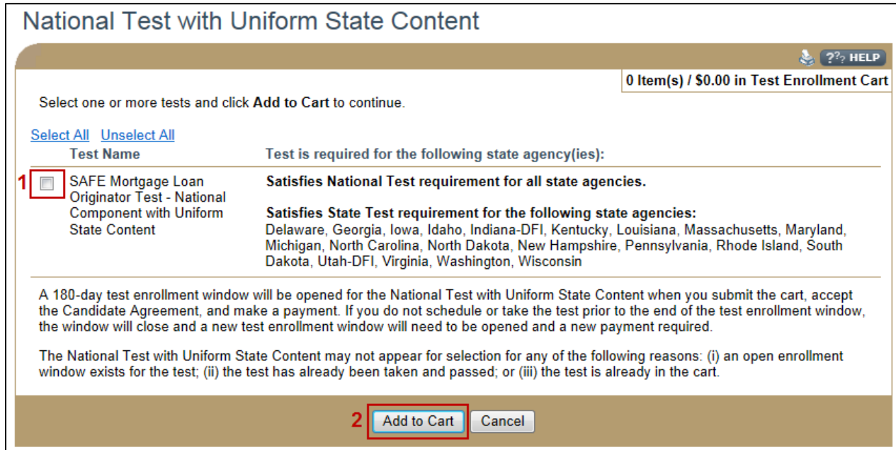
Figure 2: National Test with Uniform State Content